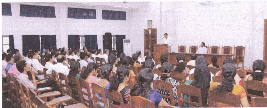
Figure15: Orientation programme for teachers (07.08.2016)