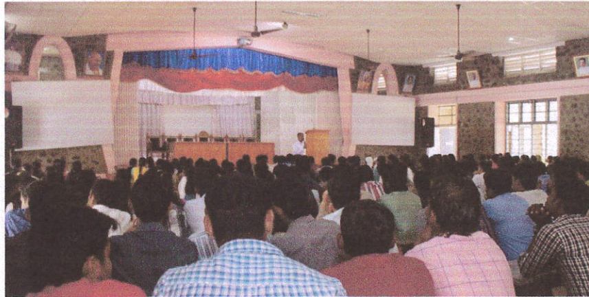
Figure 8: Student's Ethics: Programme UG students (10.02.2015)

AFFILIATED TO MAHATMA GANDHI UNIVERSITY, KOTTAYAM, KERALA