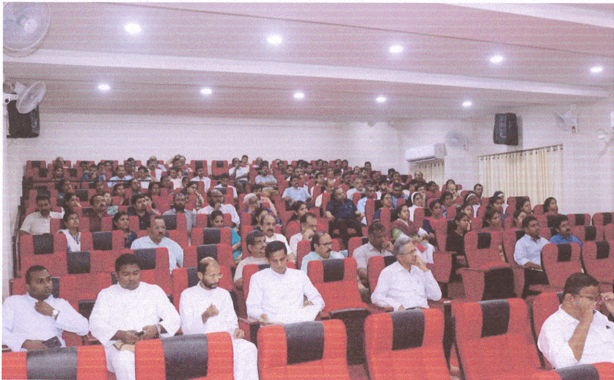
Figure 20: Class on code of conduct for teachers and administrators (22.02.2019)

+91 4822 212317 +91 9188420859 +91 9447140859