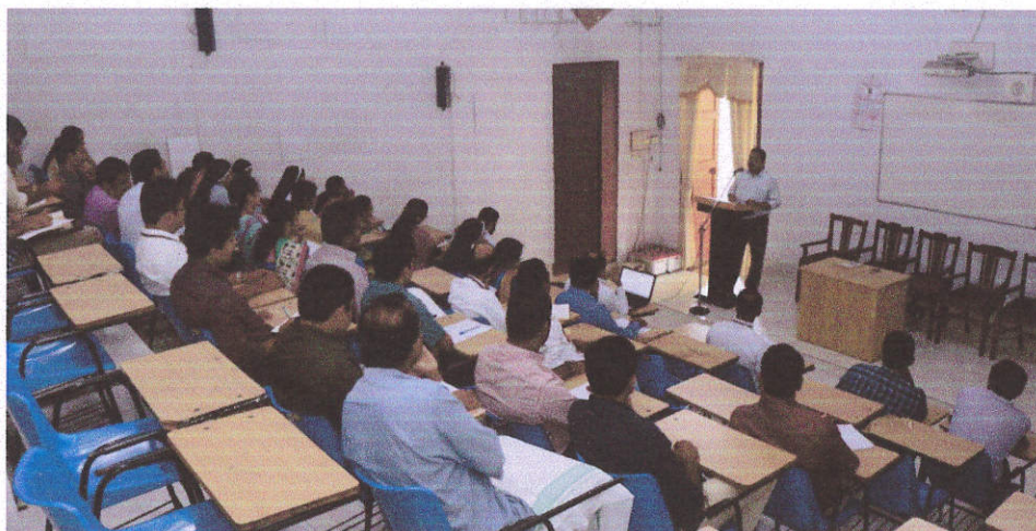
Figure 17: A class on code of conduct of teachers as invigilators in University Examinations (22.07.2017)

AFFILIATED TO MAHATMA GANDHI UNIVERSITY, KOTTAYAM, KERALA