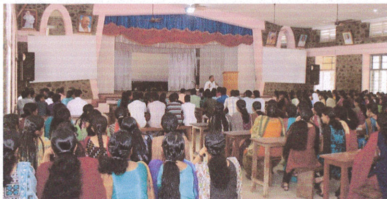
Figure 10: Student's Ethics Programme for PG students (11.02.2015)