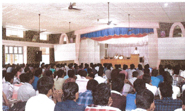
Figure 2: Initial orientation programme for I year UG students (30.07.2014)

+91 4822 212317 +91 9188420859 +91 9447140859