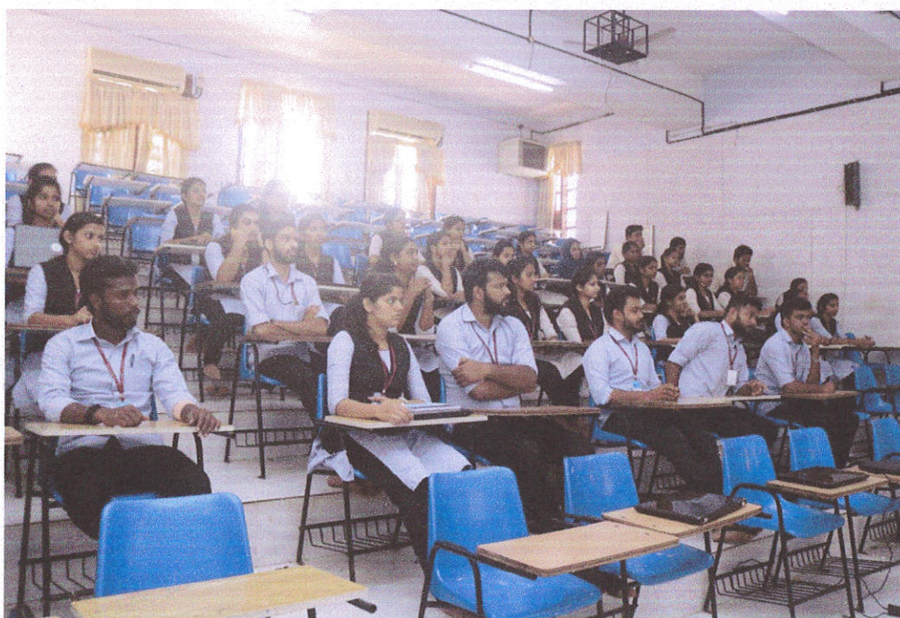
Figure 18: Orientation programme for PG students (03.01.2018)

+91 4822 212317 +91 9188420859 +91 9447140859