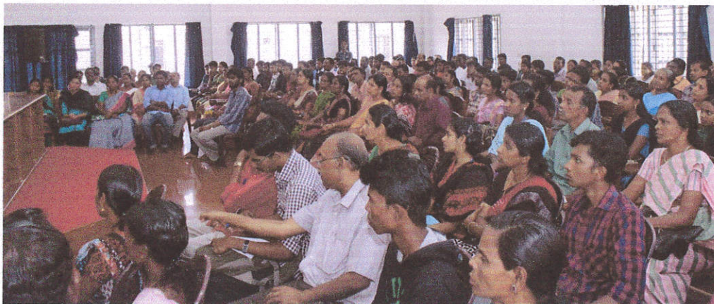
Figure 7: A special orientation programme on student's ethics for students and parents (07.02.2015)

+91 4822 212317 +91 9188420859 +91 9447140859