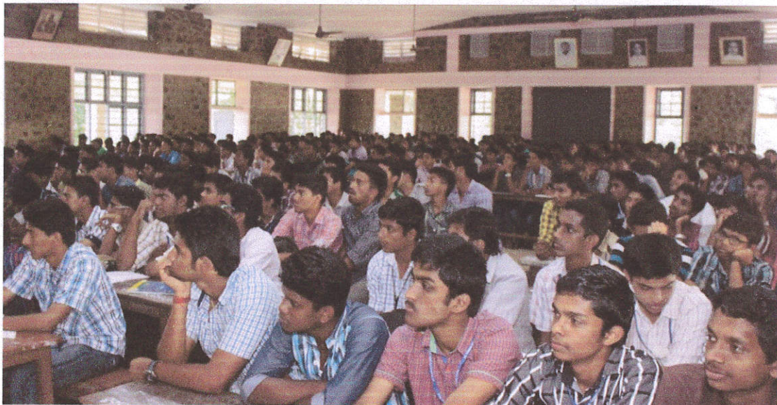
Figure 4: Emotional Stress and Behavioral Problems: Solutions from Yoga: Programme for UG students (05.11.2014)

+91 4822 212317 +91 9188420859 +91 9447140859