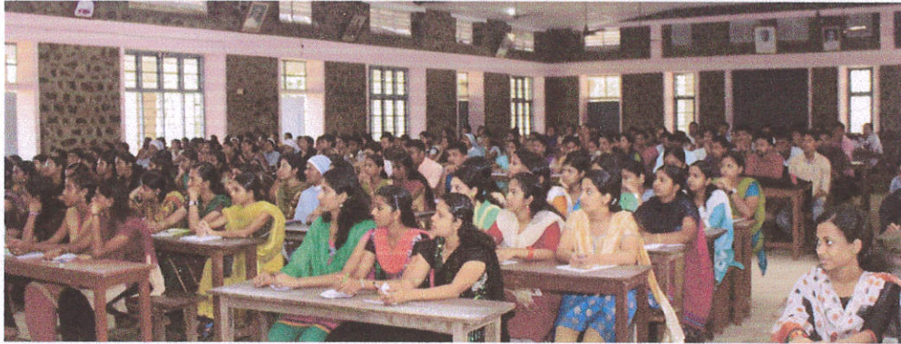
Figure 5: Student's Ethics Programme for PG students (20.11.2014)

AFFILIATED TO MAHATMA GANDHI UNIVERSITY, KOTTAYAM, KERALA