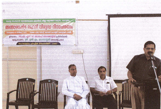
Figure 1: 'Laharivirudha' Seminar (against drug abuse) (04.07.2014)

The college organized various programmes during the period 2014-2015 to 2018-2019 for framing of Codes of Conduct for students, teachers, administrators and other staff of the college. Programmes were also organized to propagate the content, formulate a mechanism and implementation strategy and to evaluate its effectiveness. As a supporting document to the detailed annual reports, the selected photos of the important events are given below: