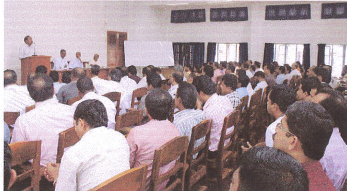
Figure 11: Orientation programme for teachers and administrative staff (11.02.2015)

AFFILIATED TO MAHATMA GANDHI UNIVERSITY, KOTTAYAM, KERALA