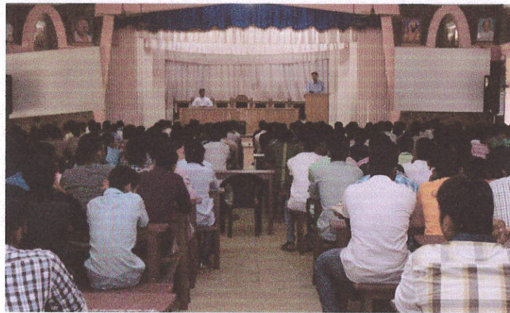
Figure 12: Student's Ethics: Programme III DC students (09.06.2015)