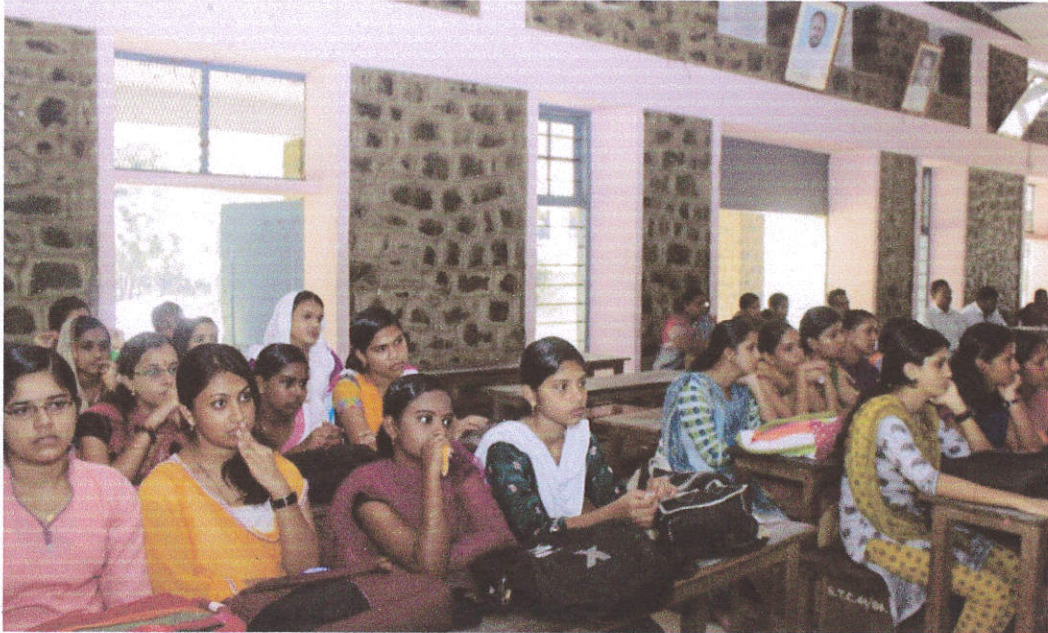
Figure 3: Initial orientation programme for I year PG students (30.07.2014)

AFFILIATED TO MAHATMA GANDHI UNIVERSITY, KOTTAYAM, KERALA