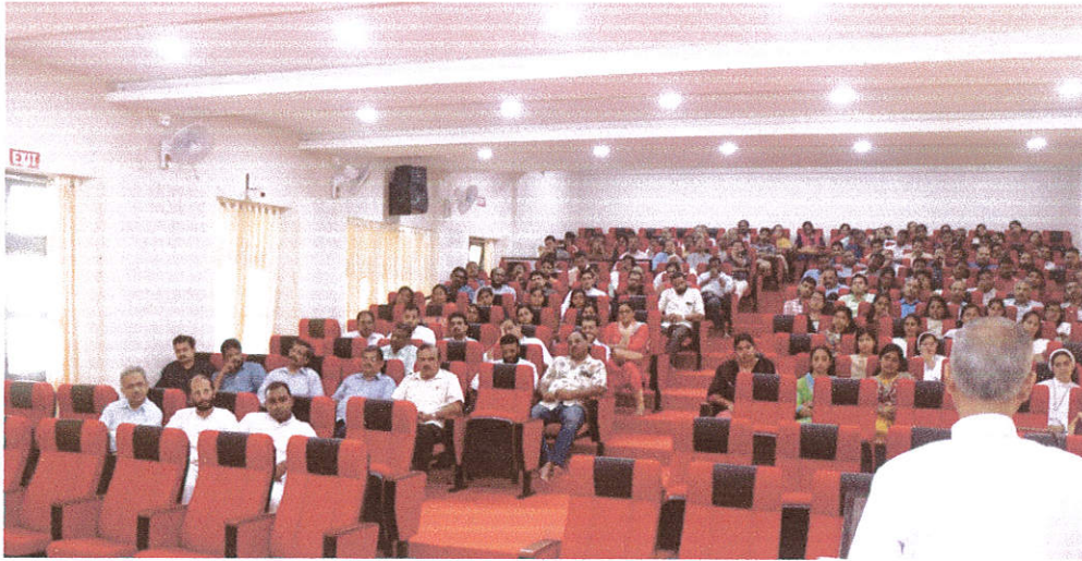
Figure 21: Orientation programme for teachers and administrators (19.03.2019)

AFFILIATED TO MAHATMA GANDHI UNIVERSITY, KOTTAYAM, KERALA