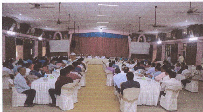
Figure 16: A combined orientation programme for teachers and administrators (28.03.2017)

+91 4822 212317 +91 9188420859 +91 9447140859