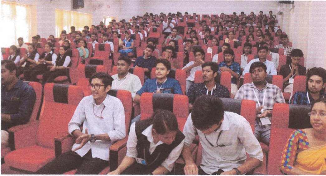
Figure 19: Orientation programme for UG students (21.11.2018)

AFFILIATED TO MAHATMA GANDHI UNIVERSITY, KOTTAYAM, KERALA