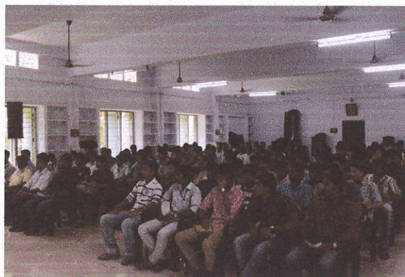
Figure 13: Laharivirudha Seminar (Drug Abuse and Solutions) (03.10.2015)

+91 4822 212317 +91 9188420859 +91 9447140859