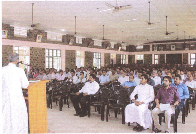
Figure 14: Ethics and Challenges of Teachers (06.08.2016)

AFFILIATED TO MAHATMA GANDHI UNIVERSITY, KOTTAYAM, KERALA